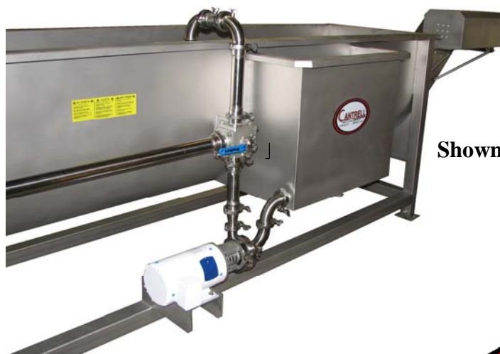
Shown with optional waterbox

We offer an optional water box for better circulation on our longer models.