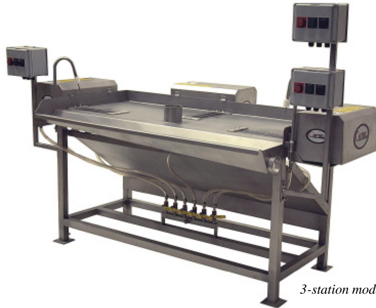
3-station model shown

Cantrell Gizzard Inspection Stations are some of the finest in the industry, capable of handling 140-182 gizzards per minute. Each roller group is operated by a designated panel box which controls the start, stop and manual reverse of the rollers. The rear set of automatic rollers receives the gizzards from the harvesting and defatting line and removes any remaining peel. Gizzards are then pulled forward for inspection and any gizzard requiring further cleaning is then guided over the manual rollers. The smooth, flush surface allows gizzards to be moved and inspected easily. Inspection stations are available in 1, 2 or 3-station models and require water and electricity for operation. Each is constructed of quality stainless steel assuring easy clean-up and minimal maintenance.