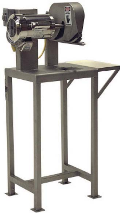
Available Wing Model shown with optional stainless motor