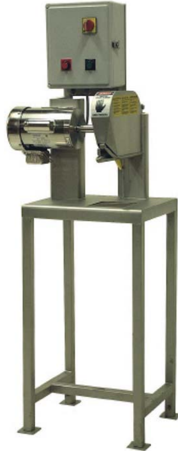
Shown with optional stainless motor

▶ The Cantrell KFC Cut-Up Saw is an economical means of producing premium poultry cut-up parts using a single skilled operator. Constructed of high grade stainless steel, all machine edges are rounded and smooth to ensure a thorough and easy clean-up. Powered by a 1 HP motor, the saw contains an easily replaceable stainless steel circular blade. The CS-100 standard unit comes complete with motor, blade and stainless steel frame. Optional blower and bagger attachments, and stainless steel stand are also available. Minimal moving parts virtually eliminate maintenance except for the blade sharpening and occasional blade arbor replacement.