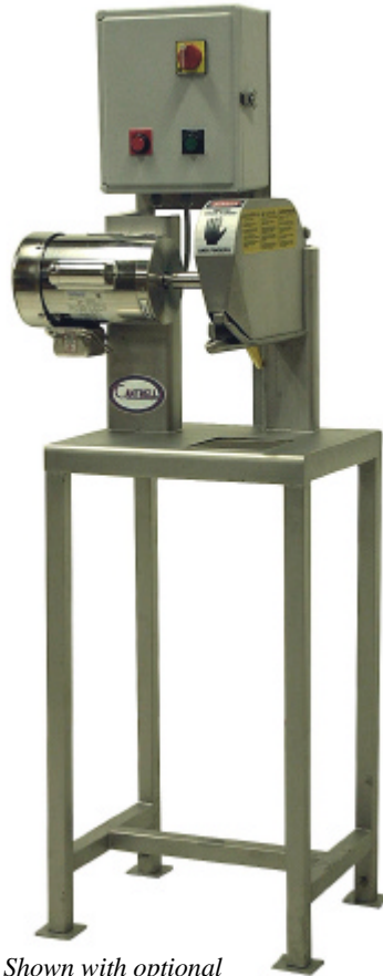
Shown with optional Stainless motor