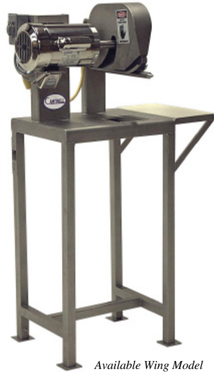
Available Wing Model Shown with optional Stainless motor

The Cantrell KFC Cut-Up Saw is an economical means of producing premium poultry cut-up parts using a single skilled operator. Constructed of high grade stainless steel, all machine edges are rounded and smooth to insure a thorough and easy clean-up. Powered by a 1 HP motor, the saw contains an easily replaceable stainless steel circular blade. The CS-100 standard unit comes complete with motor, blade and stainless steel frame. Optional blower and bagger attachments, and stainless steel stand are also available. Minimal moving parts virtually eliminate maintenance except for the blade sharpening and occasional blade arbor replacement.