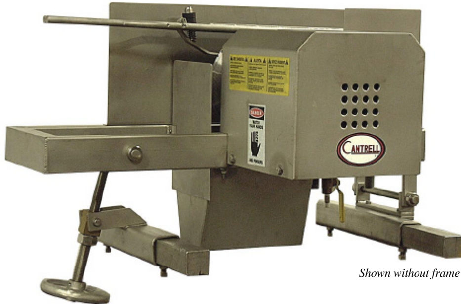
Shown without frame

Cantrell Leg Quartering machines make leg separation a breeze. Bird “saddles” are guided through the rotating blade which separate the saddle into two equal halves. Easily removable covers provide effortless cleaning and sanitation. Minimal maintenance consists of occasional blade sharpening. Constructed on stainless steel.